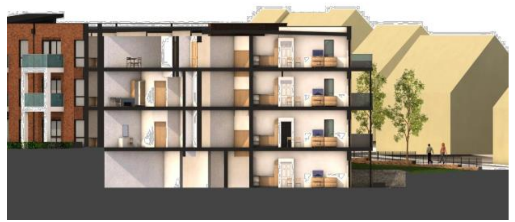
Figure 3: Section of four storey element on the NW corner Proctor Way

5.11 Due to the design of the building, discussed further below, the proposed heights of the building will assimilate into the surrounding development and are not considered to be overbearing or intrusive. The scale of the development is therefore acceptable.