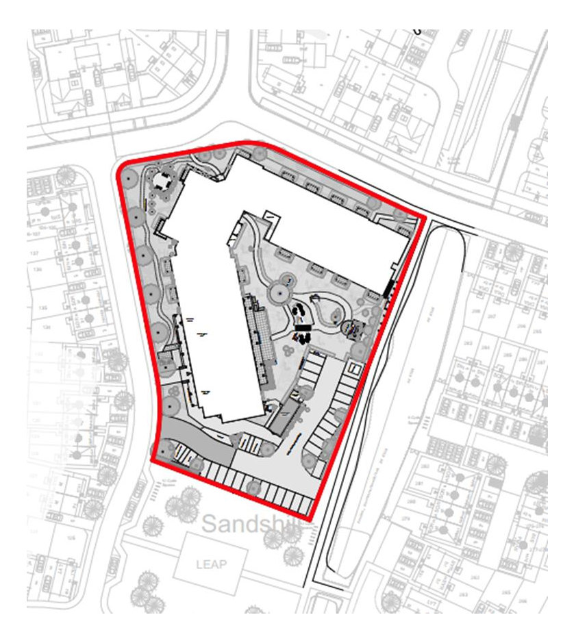
Figure 1: Extra Care Site, Land South of Park Road Faringdon